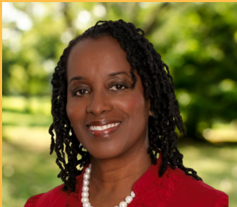
Jovanka Beckles Senate District 7