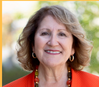
Eloise Gómez Reyes Senate District 29