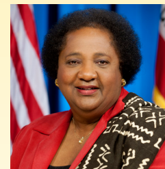
Shirley Weber Assembly District 79