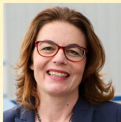
Dawn Addis Assembly District 35