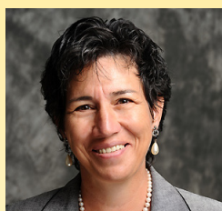
Susan Talamantes Eggman Senate District 5